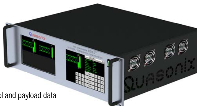
3U Rack Mount EVTM Transceiver