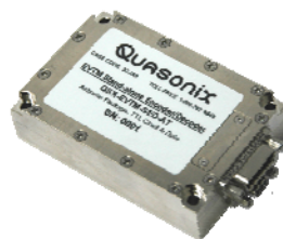
Airborne EVTM Encoder/Decoder