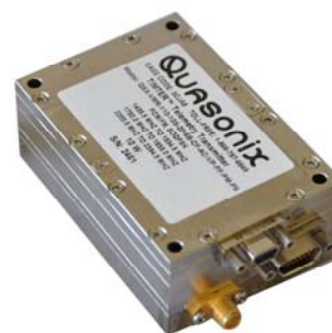
Ethernet Enabled TIMTER™ Transmitter