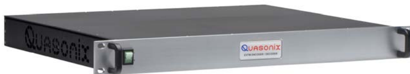
1U Rack Mount EVTM Encoder/Decoder