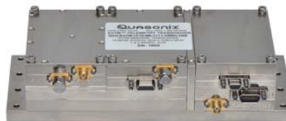
EVTM Telemetry Transceiver