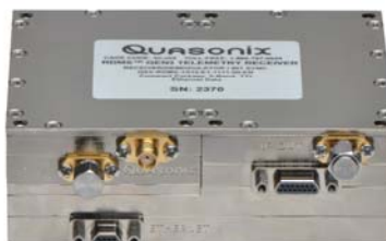
Ethernet Enabled RDMS™ Compact Telemetry Receiver