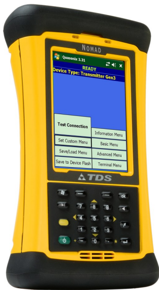
Ruggedized Handheld Programmer

The easiest way to remotely control transmitters and receivers without a bulky computer or monitor