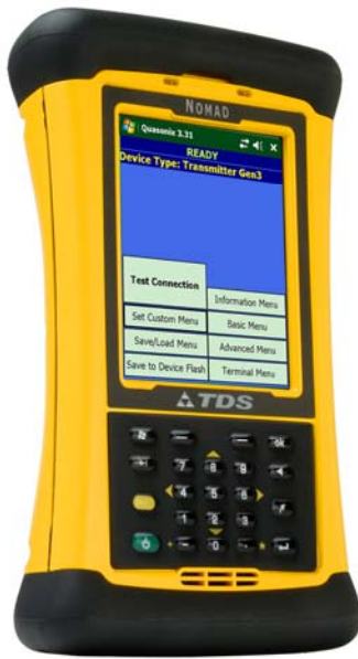
Ruggedized Handheld Programmer

The easiest way to remotely control transmitters and receivers without a bulky computer or monitor